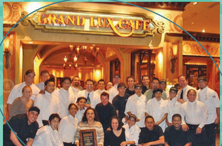
The 2007 Grand Lux Restaurant of the Year, the Venetian has grown its business from $18 million in its opening year to a projected $28 million for 2008. This year, it is expected to drop over $11 million to the bottom line—the equivalent of building two Cheesecake Factory restaurants!