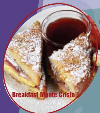
Breakfast Monte Cristo